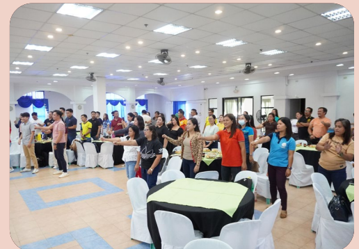
TSU introduces sports, wellness training for Tarlac school-based coaches