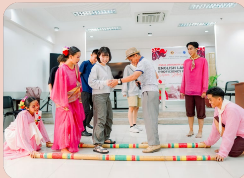
TSU welcomes 13 Japanese students for academic, cultural interchange